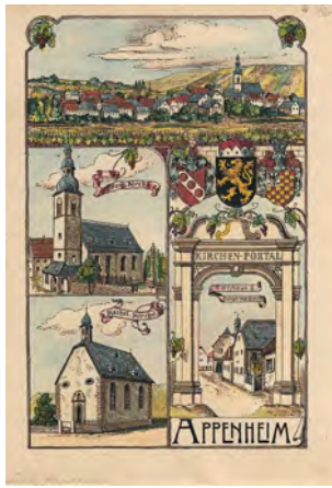
Appenheim. - Mehransichtenblatt. - "Appenheim".

Historische Ortsansicht. Kolorierter Holzstich, um 1910. 18,0 x 11,6 cm (Darstellung) / 20,3 x 13,8 cm (Blatt).